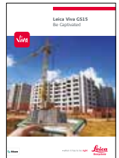
Leica Viva GS15