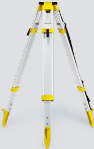
CTP104 round-base tripod Aluminum tripod with carrying straps, fast clamps, 5/8" screw. Telescopic from 85–160 cm Item no. 767 710

Optimize the performance of your Leica NA700 level with the specially tailored accessories.