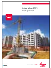
Leica Viva GS15