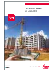
Leica Nova MS60