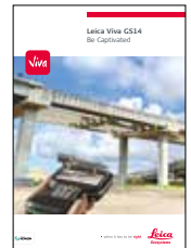
Leica Viva GS14